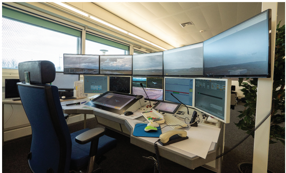
The working station for air traffic control of Saarbrücken Airport in the remote tower centre in Langen. Optimally adapted to the needs of the ATCOs. The entire control environment can be grasped by the controllers at a glance.

Remote digital towers (RDT) are not new and have already been implemented and put into operational use around the world; experience and lessons learned have been gained. The remote tower solution Frequentis and the German air navigation service provider (ANSP), DFS Deutsche Flugsicherung (DFS), developed, has been successfully managing air traffic